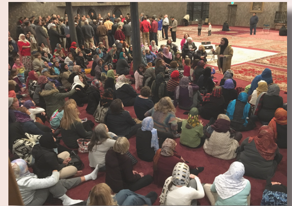
Getting to Know Our Muslim Neighbors

Prepared and issued by Cincinnati's Bridges of Faith TRIALOGUE with an assist from Harrod + Associates LLC - Design & layout by N's Design Graphic Solutions